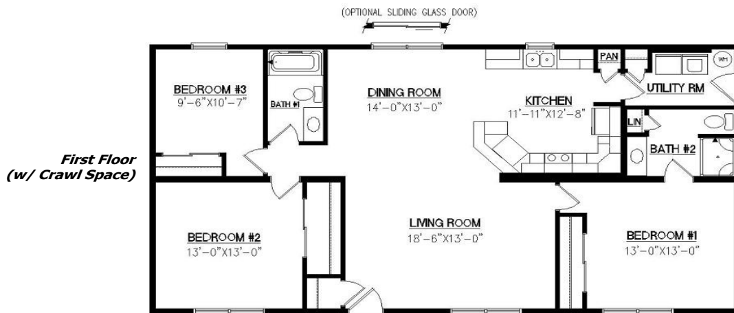
First Floor (w/ Crawl Space)

Ranch 27'-6" x 52'-0" 1430 SQFT 3 Bedrooms / 2 Baths