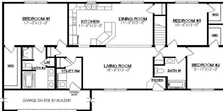
First Floor (w/ Basement)

Note: Renderings are for illustrative purposes only and may vary per series standard specifications.