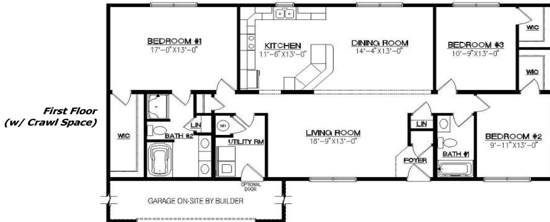
First Floor (w/ Crawl Space)

Ranch 27'-6" x 60'-0" 1650 SQFT 3 Bedrooms / 2 Baths