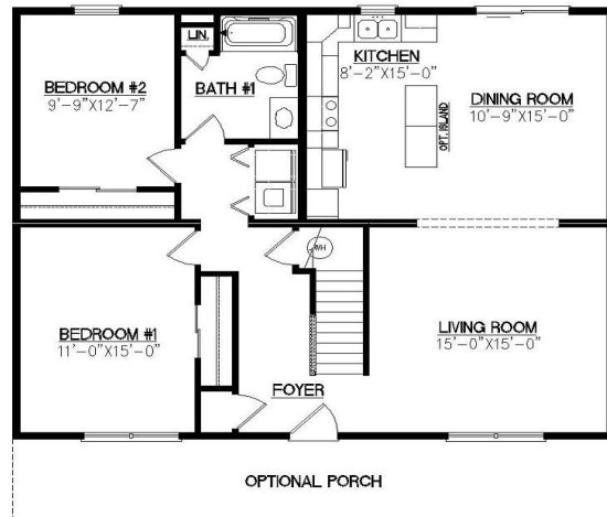
First Floor (w/ Crawl Space)

Note: Proposed second floor available upon request.