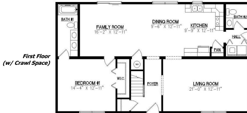
First Floor (w/ Crawl Space)

Note: Proposed second floor available upon request.