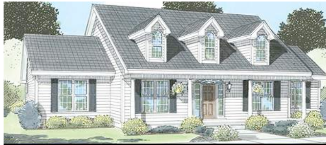
Custom Select Williamsburg