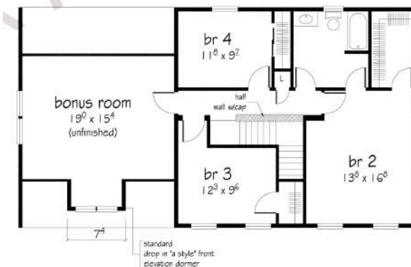
Waterford II 2 nd floor plan 313 sq. ft. unfinished