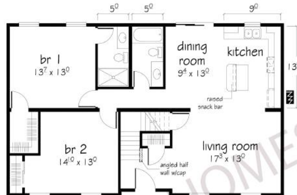
Mount Vernon II 1 st floor plan 27 6 x 44 0 1208 sq. ft.